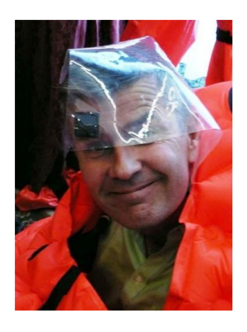
At 10 pm the evening continued at Zuggys Base Camp......