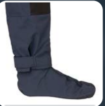
Ankle cuffs and ultrasonic welded fabric socks.