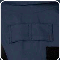
Microphone holder on upper chest for communication radio.