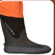
Xlite Neoprene Softboots.