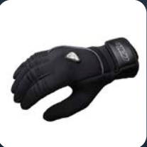
A soft and flexible multi purpose 1.5mm Neoprene glove with Amara leather reinforcements.