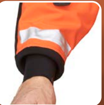
Neoprene superstretch wristseals.