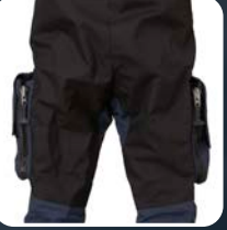
Reinforced Cordura Seat.