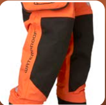
Reinforced and padded knee.