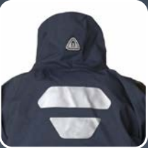
Reflective patches on key positions.