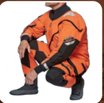
The suit's design and construction is optimized for high mobility.