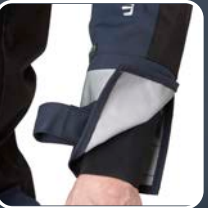
Neoprene seals and adjustable cuffs.