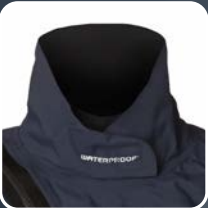
Neoprene neck seal and an extra high collar.