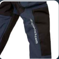
Reinforced and Padded knees and elbows.