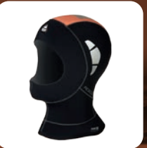
A very comfortable 3mm rescue hood with reflective patches and perforated "sound holes" for better hearing.