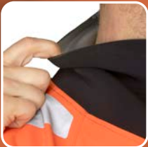
Neoprene superstretch neckseal.