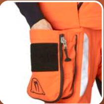
Expandable leg pockets.