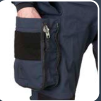
Dual expandable pockets.