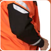
Reinforced and padded elbows.