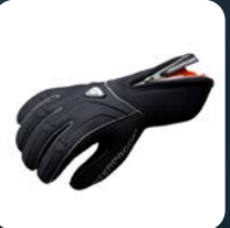
A warm and comfortable 3mm Neoprene glove, 3D-shaped with pre bent fingers extra long cuff, YKK zipper and reflective patch.