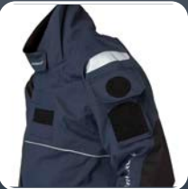
Loop patches for name/ unit info.