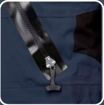
Flexible and lightweight TIZIP front zipper.