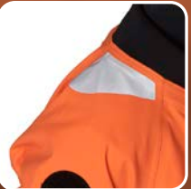
Reflective patches on key positions.