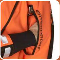
Low profile arm pockets.