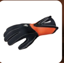
A 3mm ergonomic rescue glove with pre bent fingers, extra long cuff, YKK zipper and reflective patch.