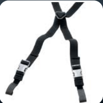
Adjustable suspenders is standard.