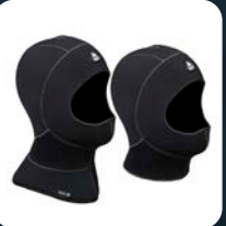
3/5mm Hood 3-D shaped in superstretch Neoprene.