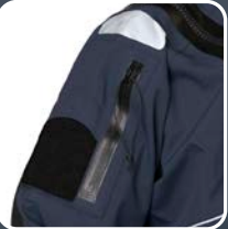
Waterproof arm pocket.