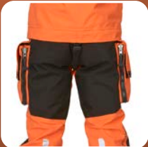
Cordura reinforced seat.