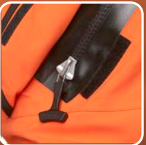
TIZIP Front zipper.