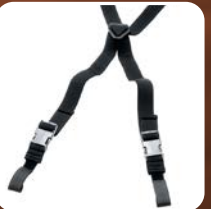
Adjustable suspenders is standard.