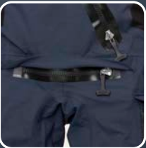
Relief zipper from TIZIP.