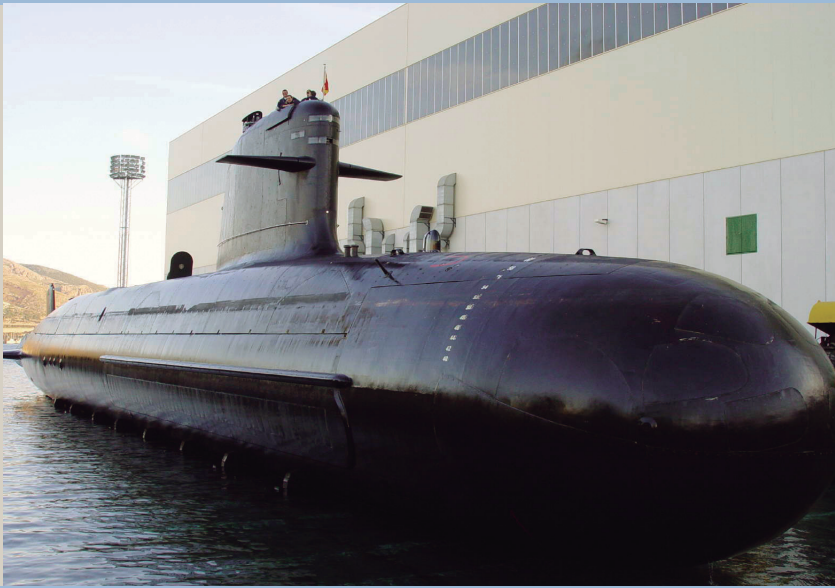
S hiplift and Transfer System for ships and submarines of the Shipyard and Naval Base of Itaguaí.